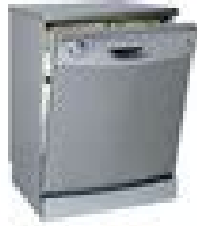
DEFY DISHWASHER Premium